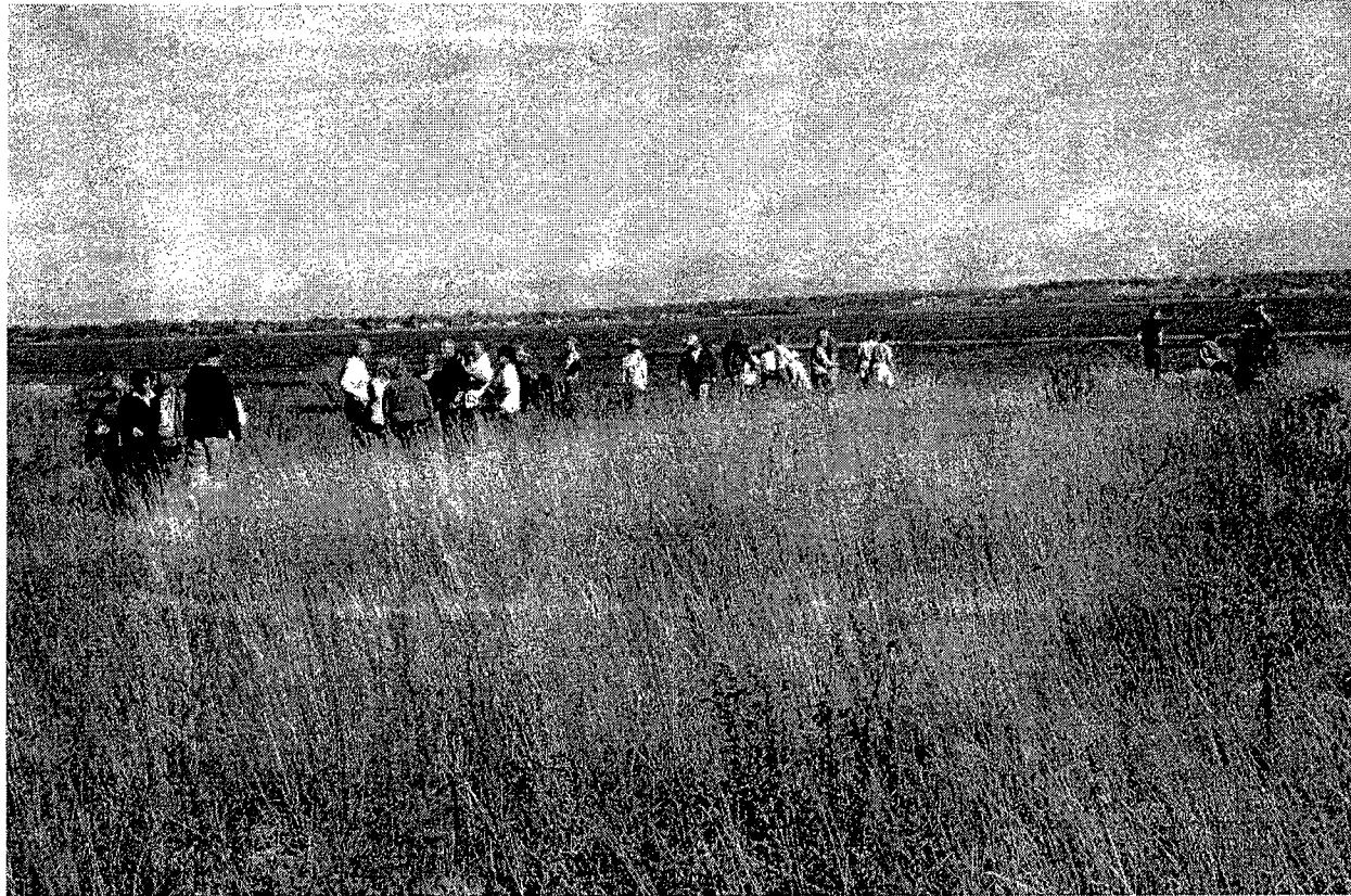
Scott Avedisian, Mayor