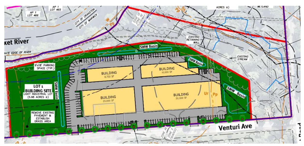
Master Plan, May 2022

The project has been redesigned as of May 24, 2022, but remains relatively unchanged. In comparison, the proposed square footage has been reduced by 1,250 square feet. The applicant is still requesting to subdivide the parcel into three parcels, the proposed parcel sizes have not changed. The reduced square footage results in a reduction of seven required parking spaces.