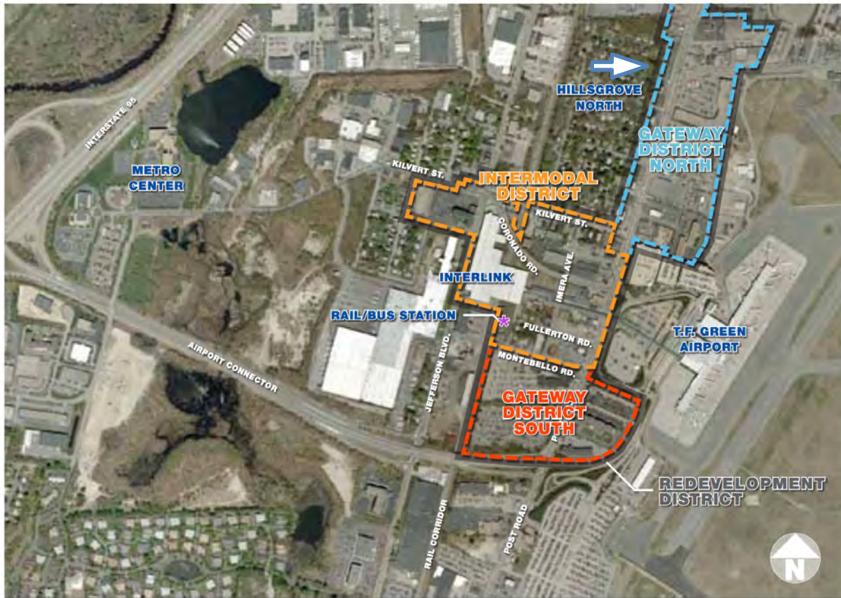
Master Plan context