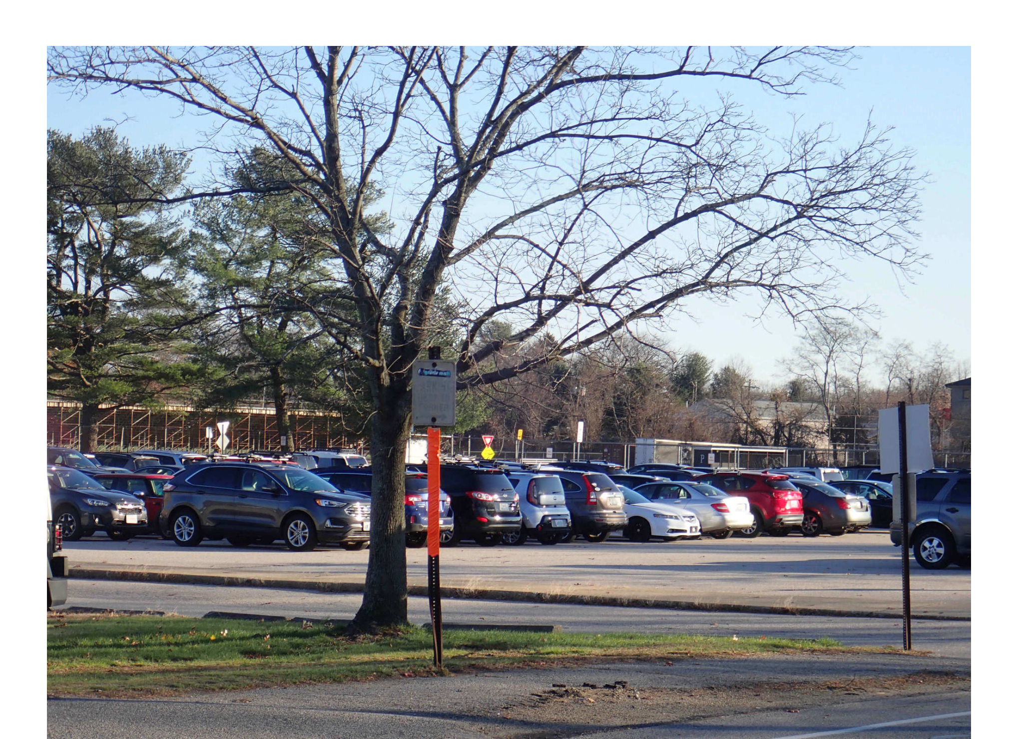
Image Associated With Case Number 22-6887-OF Image Description: SCHOOL FRONT