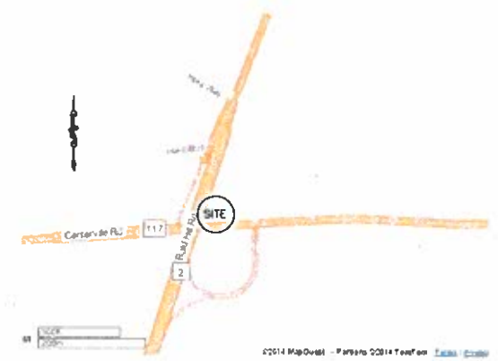
LOCUS MAP NOT TO SCALE