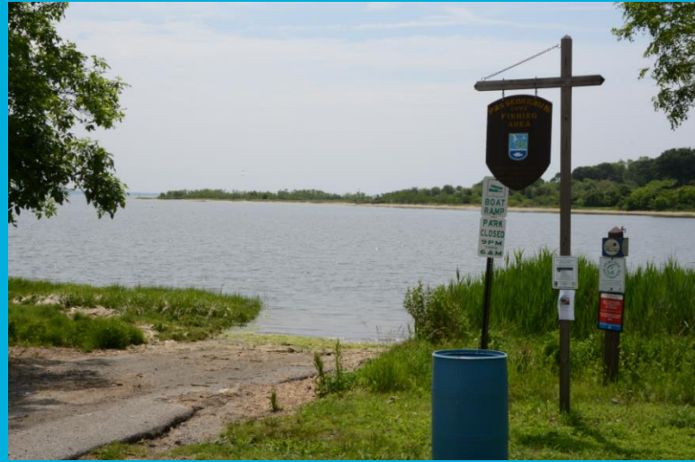
SCENERY: Historic Pawtuxet Village, open bay with possible commercial ships passing in the Providence River channel and secluded coves with wildlife.

PAWTUXET COVE offers views of Colonial dwellings and magnificent homes along the shore. At the head of the cove, the Pawtuxet River empties into the bay. Pawtuxet Cove is protected by a breakwater (known as Rock Island), so the challenge to paddling around the cove is not waves, but boat traffic in and out. Be aware of sail and power boats moving through the cove. The lower Pawtuxet River area was settled in 1638 with a purchase from Saconoco, Chief Sachem of the Pawtuxet group of Narragansett Indians (Pawtuxet means little falls). You can paddle up to the falls under the Pawtuxet Bridge (1) to the site where Stephen Arnold and Zachariah Rhodes constructed a wooden dam and grist mill. The dam was replaced; and the river remained dammed at this spot until 2011, when it was removed to allow passage of anadromous fish (and canoes and kayaks) up the river. River herring and American shad have been stocked in the river, and during spring migration, you may see these fish at the foot of the falls moving upstream to spawn. During King Phillip's War, the Indians burned the village in January of 1676. It was rebuilt and was a ship building town, a center for import and export with a